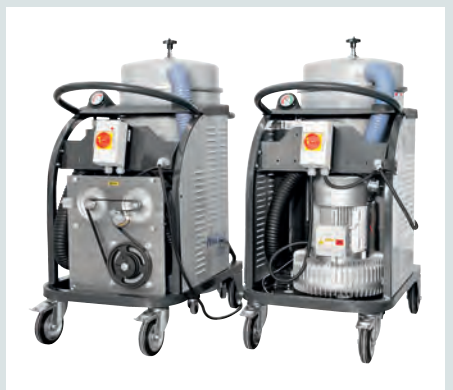
Turbine or lateral channel vacuum unit