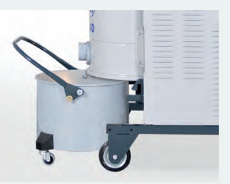
Container release system