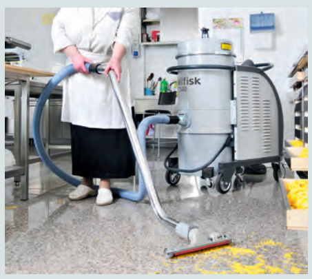
Collection of pasta, flour and sugar