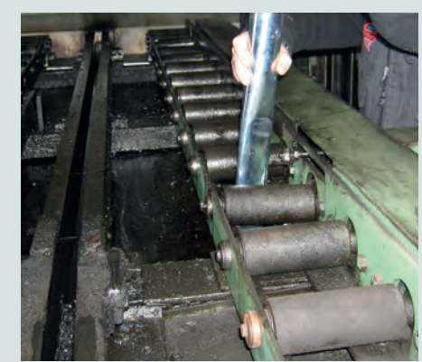
Vacuuming grinding sludge