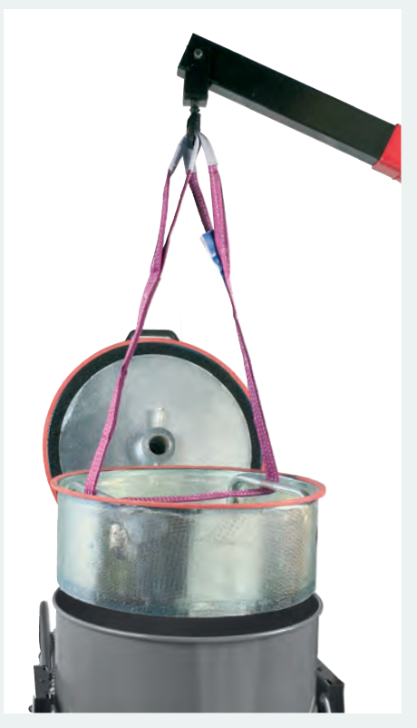
Belt for an easy lifting and emptying