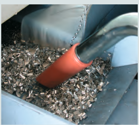
Collection of large quantities of chips