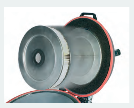
Filter for oil mists. It prevents particles of oil and water from becoming airborne