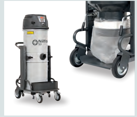
S3 with gravity unload system with Longopac®