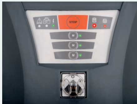
Electronic board control