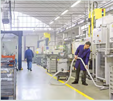
Cleaning of a metal company