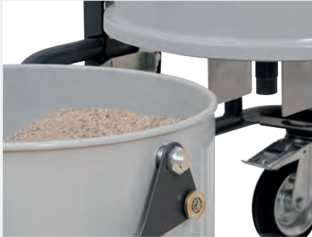
Solid cut-off system