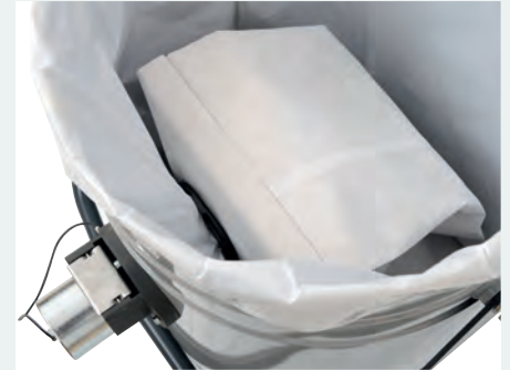
Safe bag for toxic material