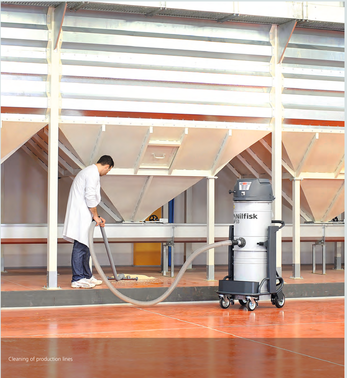
Cleaning of production lines