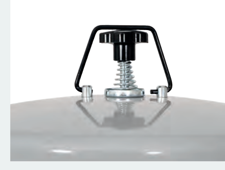
Manual filter shaker