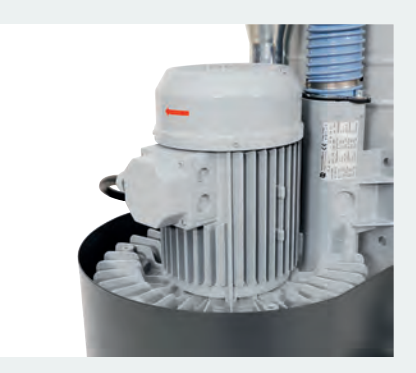
Blower: silent and reliable