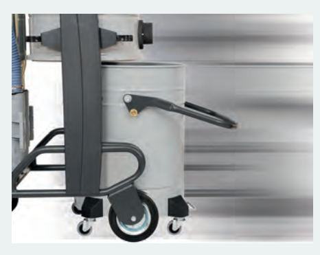
Container with castors and handle: practical