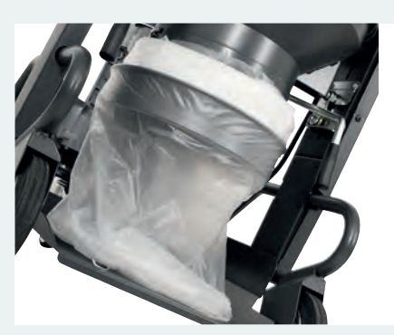
Gravity unload system with Longopac®