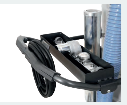
Cable holder and accessory box: functional