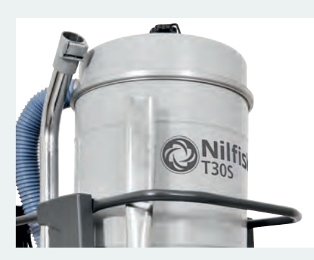
Handgrip holder: all the accessories are close to the operator