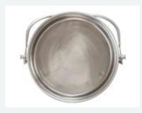
The stainless steel container is smooth and internally rounded. Fully autoclavable