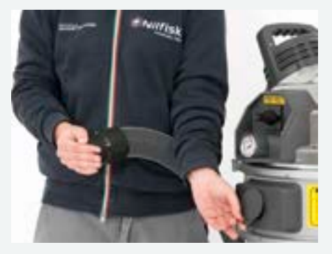
PullClean filter cleaning system: close the inlet and pull the flap rapidly and several times.