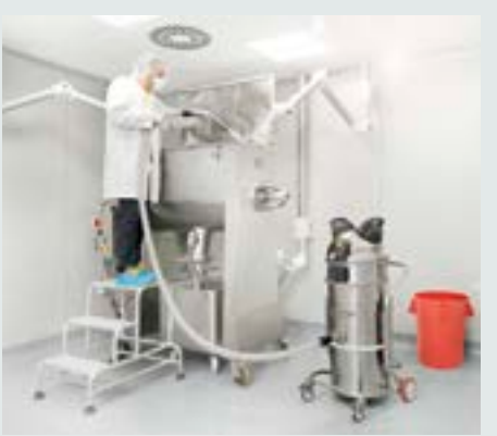
For wet and dry applications in cleanrooms