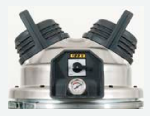
Vacuometer to monitor constantly the vacuum cleaner performances